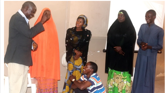
Life-skills Training for the Deaf