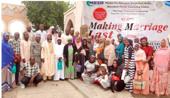
Marriage Education in FCT