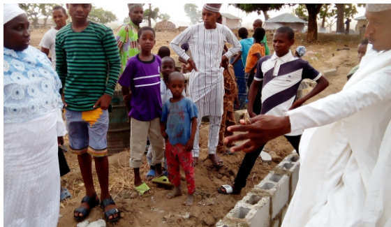
Building of Nomadic schools