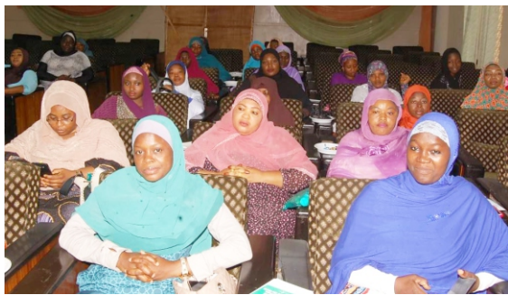
.Marriage Education in some States sponsored by Hajia Aisha Buhari (wife of the President of Nigeria)