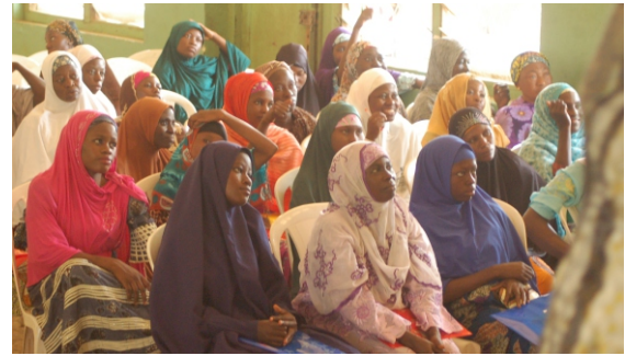
Women Economic Empowerment