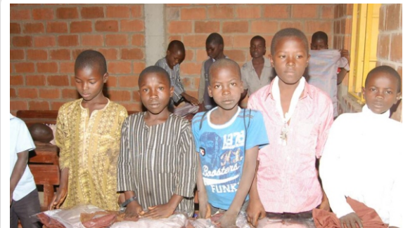
Provision of welfare to 'Almajiri' in FCT