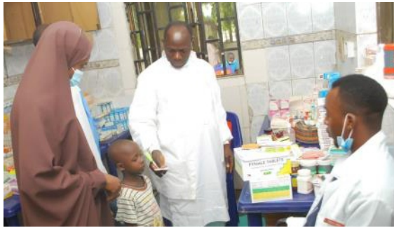
Medical Outreach programmes